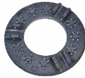
Clutch Pressure Plate (Coil Spring type)