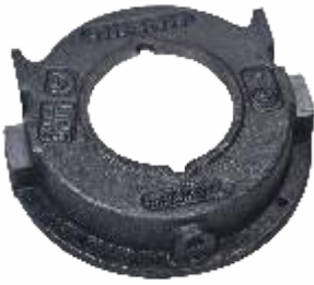
Clutch Release Bearing Housing