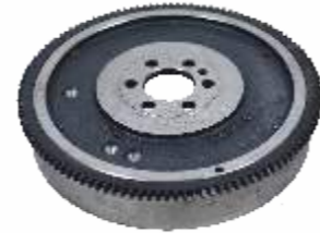
Flywheel Assembly 170-380 Dia