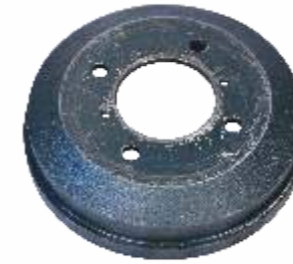
Brake Drum (LCV-MCV-HCV)