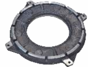
Clutch Pressure Plate (Diaphragm type)